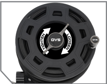
EASILY REEL HOSE AND KEEP AIR LINE ORGANIZED