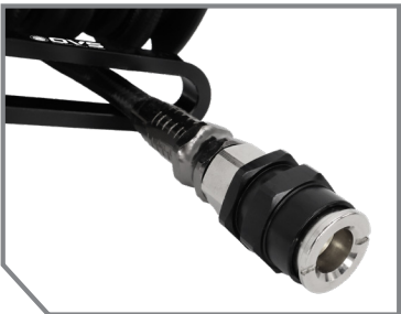
QUICK-CONNECT US STANDARD FITTINGS