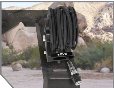
WALL OR RACK MOUNTABLE FOR VERSATILE SET UP

Keep your air line organized, tangle-free, and ready for action. The retractable design saves setup time and extends hose life. Perfect for pairing with onboard air or compressors during tire fills and tool use.